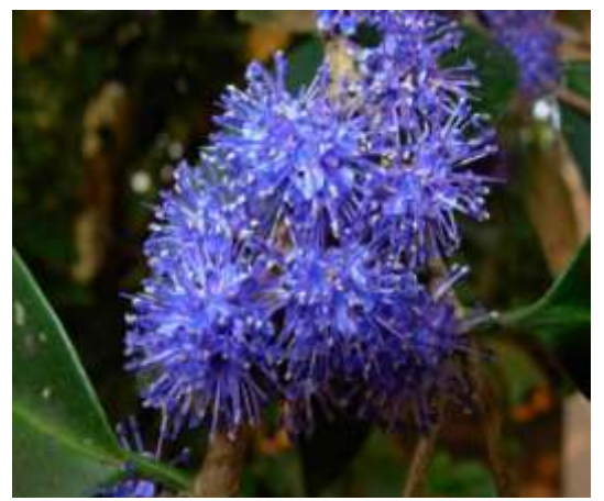
Figure 01:Memecylon umbellatum